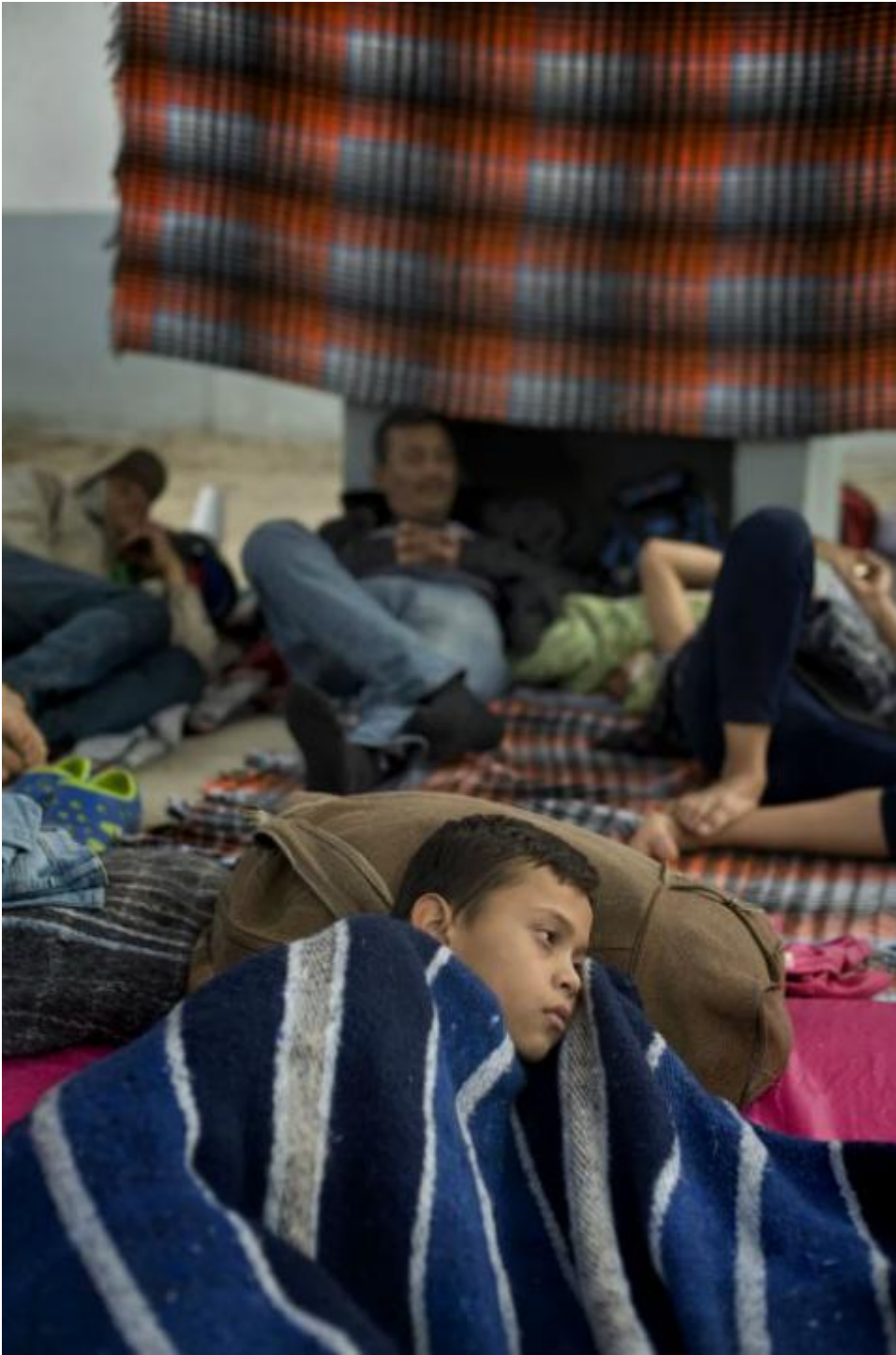
A boy rests at a shelter at a sports facility in Tijuana, Mexico, set up to for people arriving Nov. 15 in a caravan of Central American migrants at the U.S.-Mexico border. The shelter opened the previous night and had more than 750 people, but dozens more lined up outside waiting to enter.