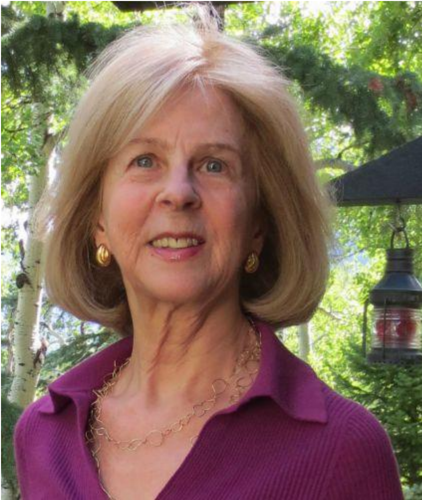
Elaine Pagels

Such beliefs usually had roots in sacred texts. For instance, she notes, "Creation stories help create the cultural world by transmitting traditional values." Which caused her to keep wondering, "Why do people continue to tell such stories to this day? What do these stories mean to them?"