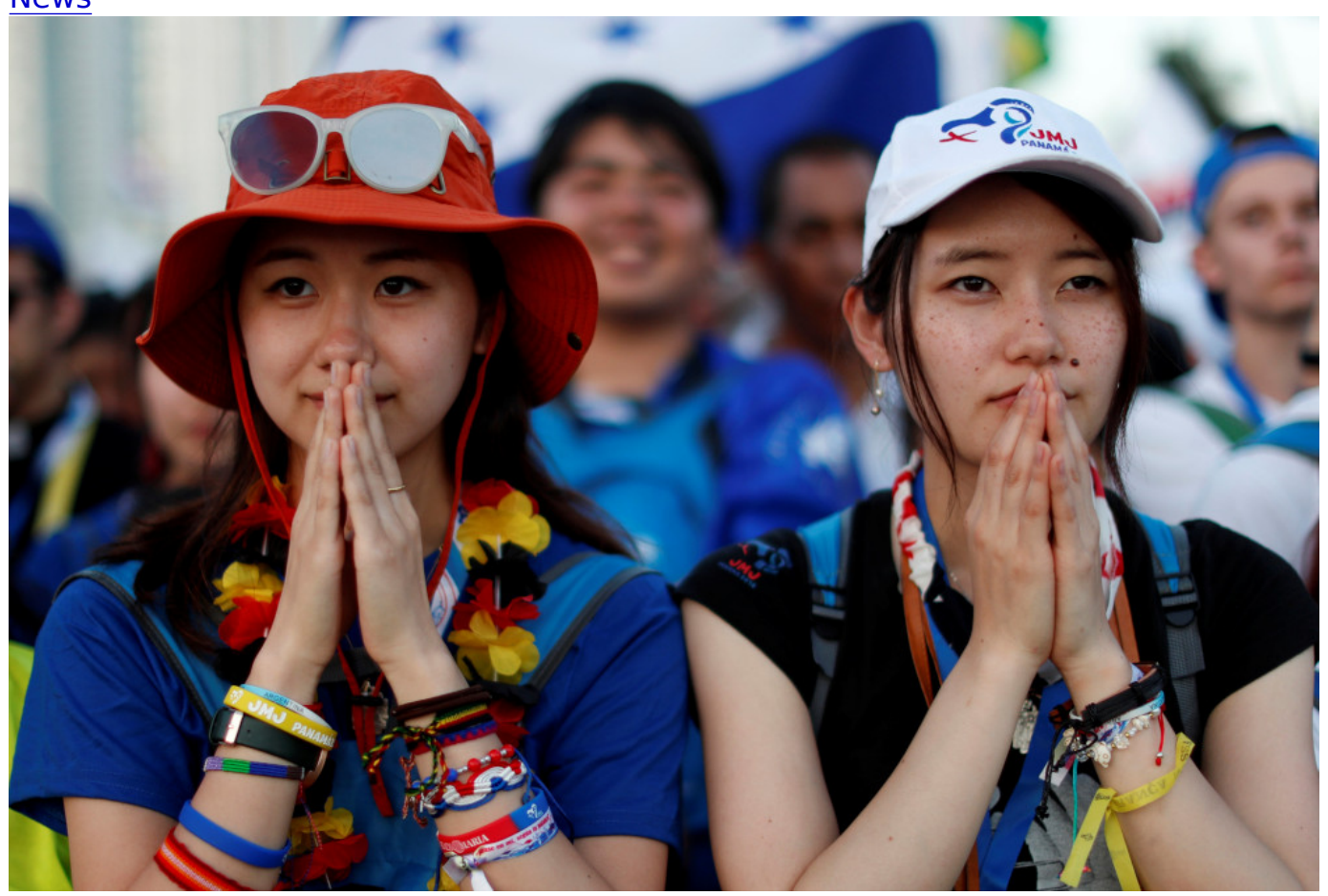
Pilgrims pray during the opening Mass of World Youth Day in Panama City Jan. 22, 2019.