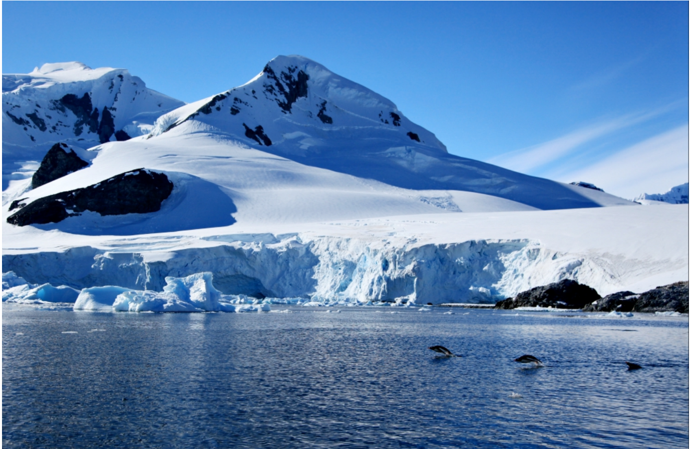
Paradise Harbor, Antarctica