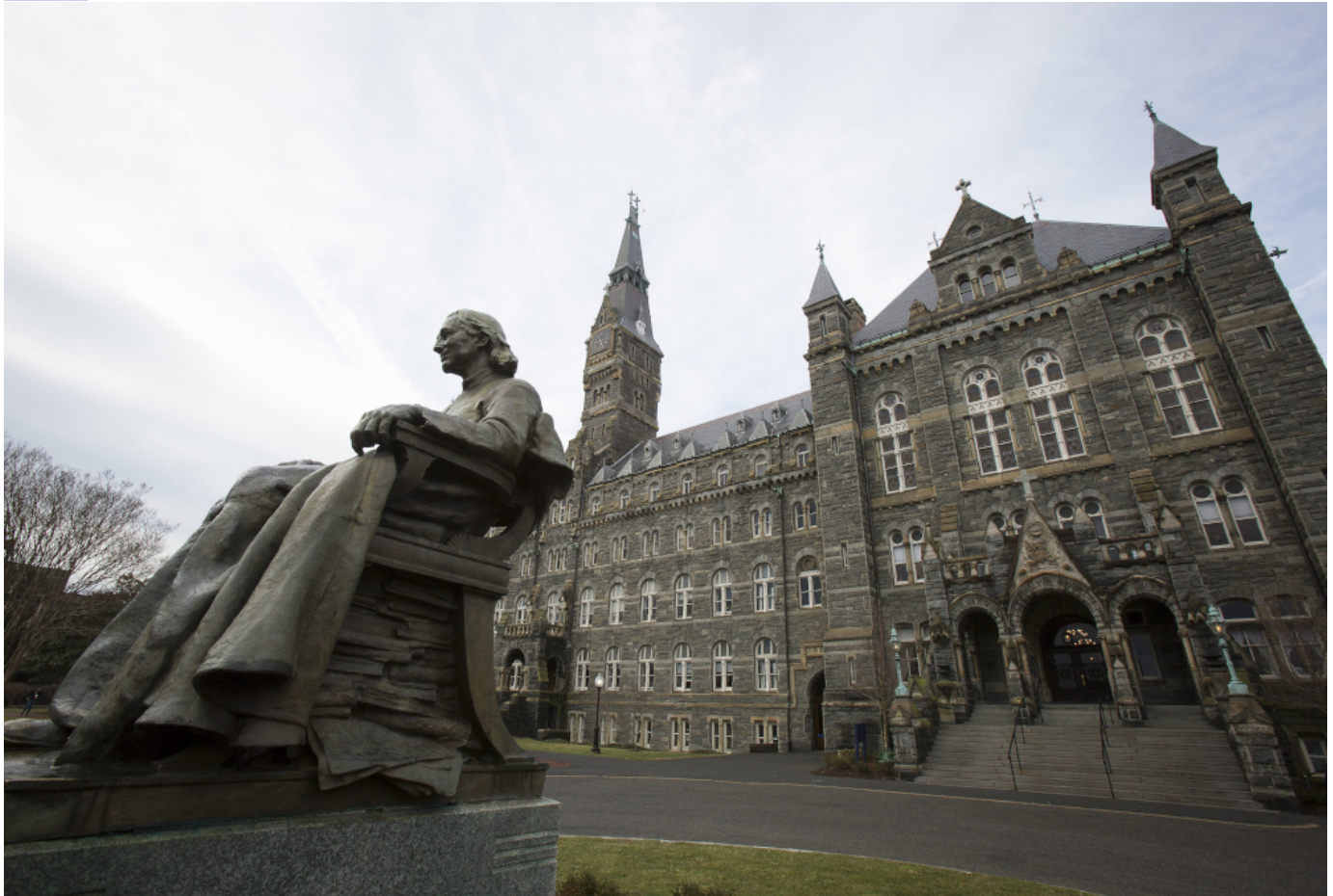
Georgetown University in Washington is seen Feb. 15, 2018.