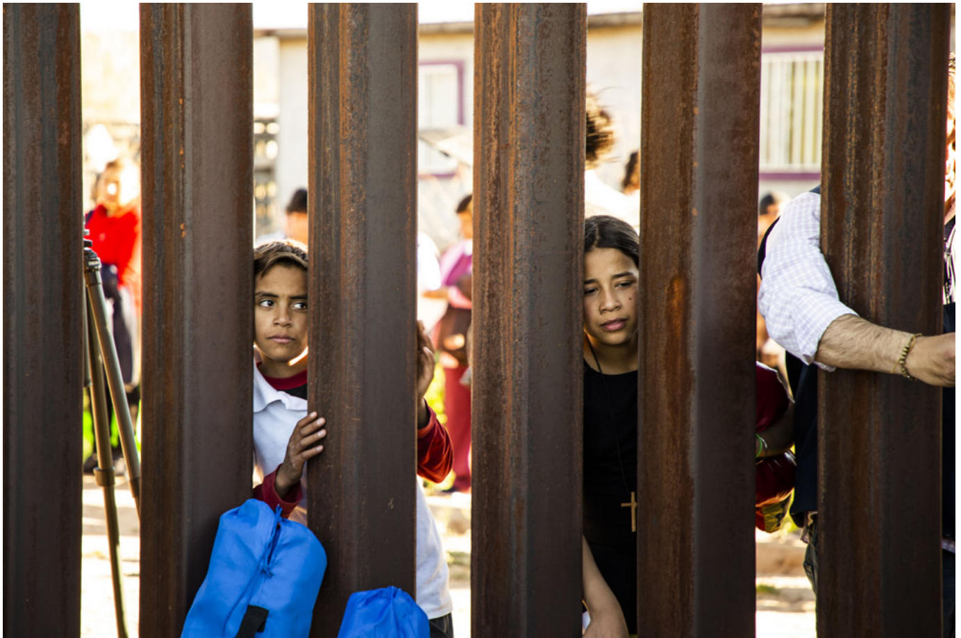
Curious children peek through the Anapra border fence.

Many of the laity at the Anapra event, myself included, are already responding "on the ground," devoting long hours to care for the growing needs of immigrant families. Dozens of temporary hospitality centers have cropped up throughout the area known as the borderlands, from east El Paso to southern New Mexico.