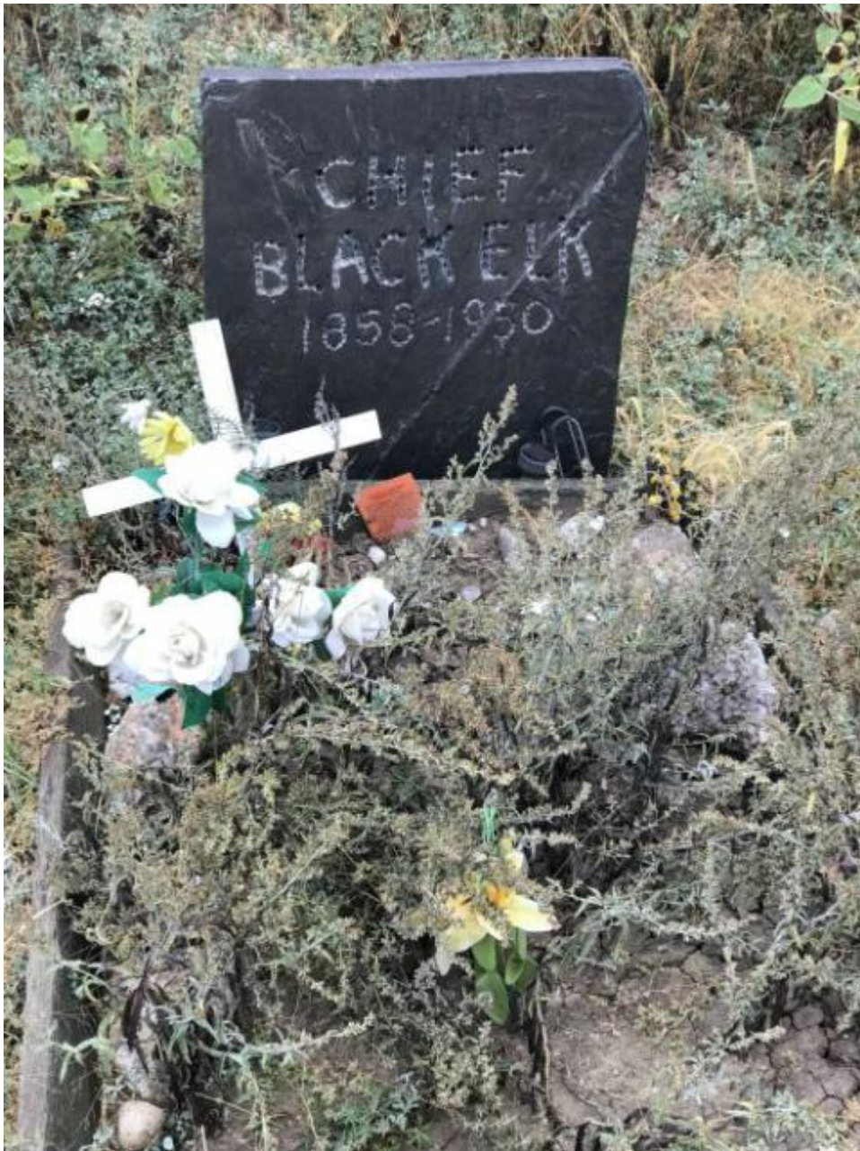
Nicholas Black Elk's grave in St. Agnes Catholic Cemetery in Porcupine, South Dakota, on the Pine Ridge Reservation (Tim Uhl)

On the main campus, there are three schools (elementary, middle and high school), with a large number of Jesuits and volunteer teachers through Creighton University's Magis Catholic Teacher Corps, a postgraduate service teaching program. Most of the teachers are encouraged to obtain a commercial driver's license so they can drive one of the eight bus routes. All told, the teacher-drivers cover 1,000 collective miles daily to enroll their 600 students.