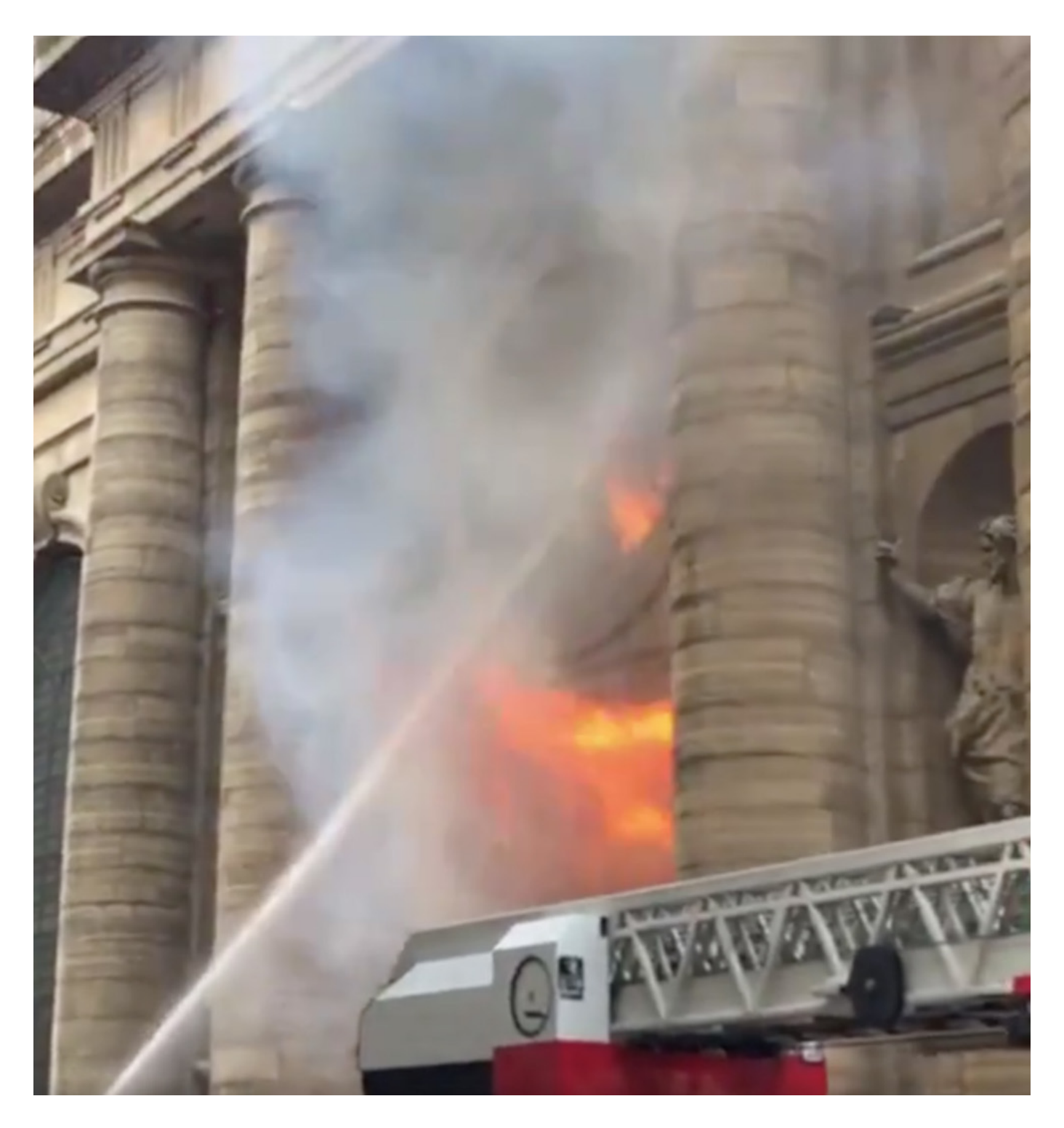
French firefighters extinguish flames during a recent fire at St. Sulpice Catholic Church in Paris. Video screenshot (RNS)

But apart from official denunciations of individual attacks, Catholic leaders in France have refrained from dramatizing what they say is a worrying trend.