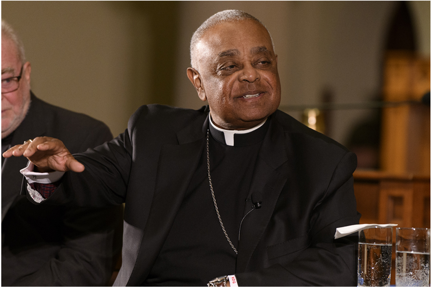
Atlanta Archbishop Wilton Gregory gestures during a panel titled "Confronting Racism in Our Hearts and in Our Nation" Nov. 13, 2017, at Georgetown University in Washington.