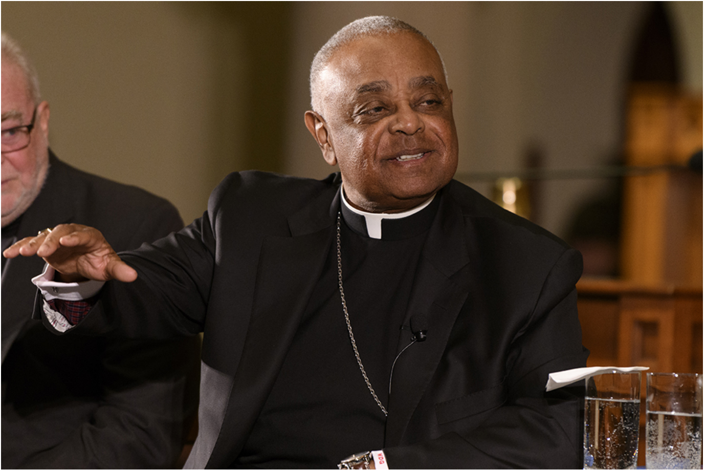
Atlanta Archbishop Wilton Gregory gestures during a panel titled "Confronting Racism in Our Hearts and in Our Nation" Nov. 13, 2017, at Georgetown University in Washington.