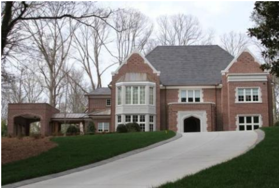
Atlanta Archbishop Wilton Gregory's residence pictured March 15, 2014

According to the Vatican's 2019 Annuario Pontificio , the official directory of the global church, the Washington Archdiocese contains some 2.3 million people, 659,000 of whom are Catholic.