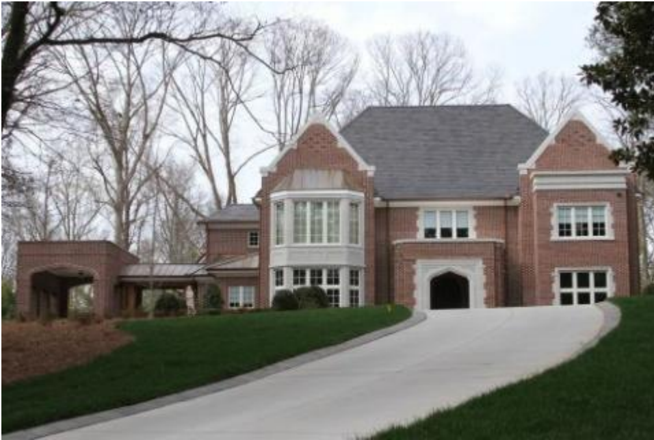
Atlanta Archbishop Wilton Gregory's residence pictured March 15, 2014

According to the Vatican's 2019 Annuario Pontificio , the official directory of the global church, the Washington Archdiocese contains some 2.3 million people, 659,000 of whom are Catholic.