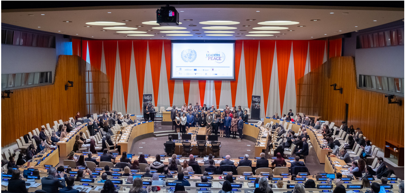
A group photo of the students from Rondine during the launch of their initiative at the United Nations building in New York.

globalization of indifference " and offers instead an option to make room for difference. As Pope Francis underscored in his message to Rondine at the Vatican before their voyage to the U.N., " only through dialogue can trust be created ," a dialogue rooted in the encounters of daily living. Indeed, what makes Rondine's peace-building efforts a recipe for success in local and international relations is their invitation to embrace convivenza , an intentional commitment to a culture of encounter lived daily by coming together with others and their distinct differences for the sake of building the common good. These young ambassadors have much to teach us about tearing down ideological "walls" that divide and polarize us.