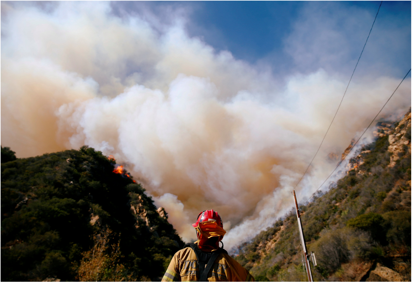
Firefighters battle the Woolsey Fire Nov. 11 in Malibu, Calif.