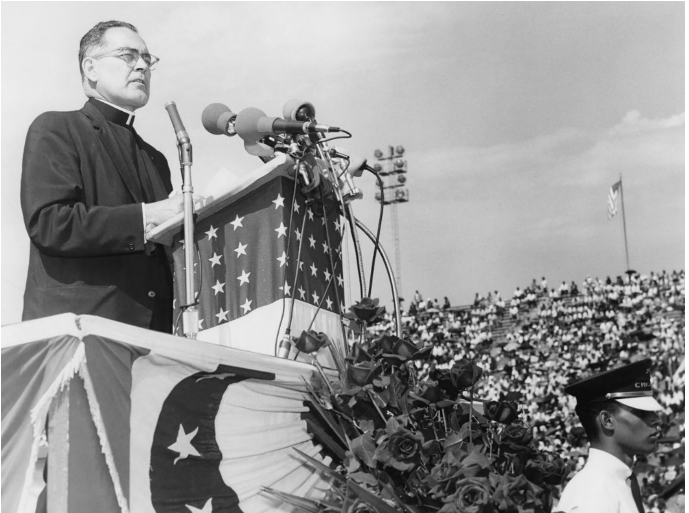
Holy Cross Fr. Theodore Hesburgh speaks at the Illinois Rally for Civil Rights in Chicago in 1964.