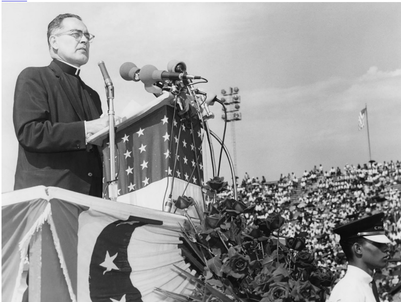
Holy Cross Fr. Theodore Hesburgh speaks at the Illinois Rally for Civil Rights in Chicago in 1964.