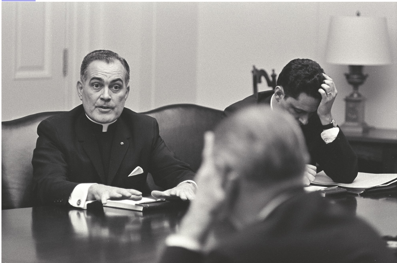
Holy Cross Fr. Theodore Hesburgh during his tenure as chair of the U.S. Civil Rights Commission