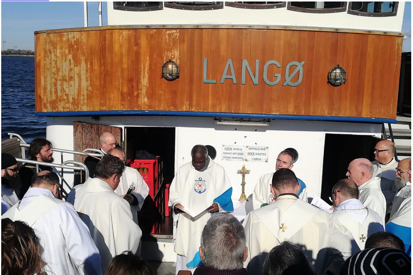
Cardinal Peter Turkson, prefect of the Dicastery for Promoting Integral Human Development, celebrates Mass onboard a ship in Copenhagen May 5 during a Vatican-sponsored conference titled "The Common Good on Our Common Seas."