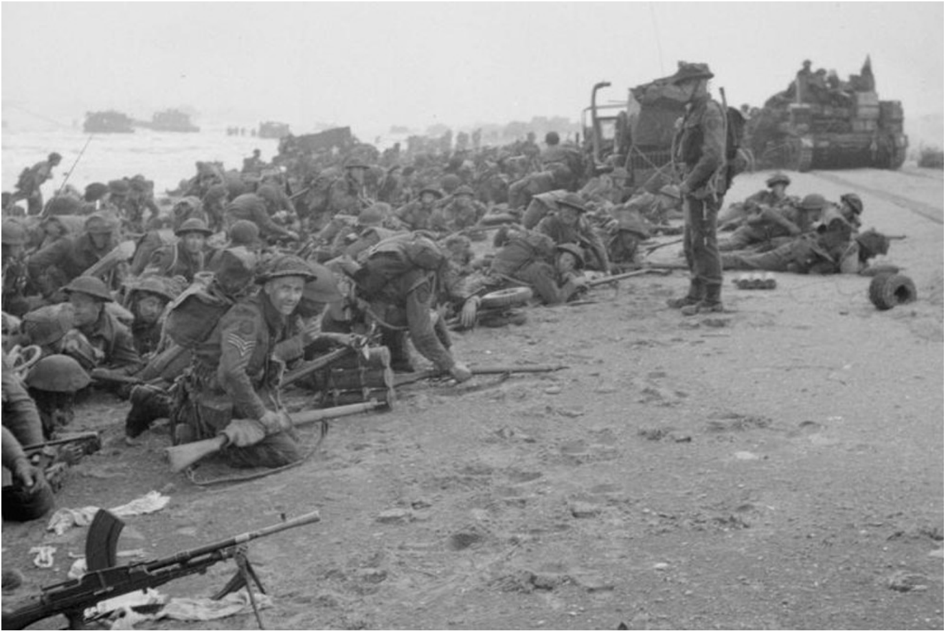
British commandos of 1st Special Service Brigade crouch on Queen beach, Sword area, before moving inland on June 6, 1944.