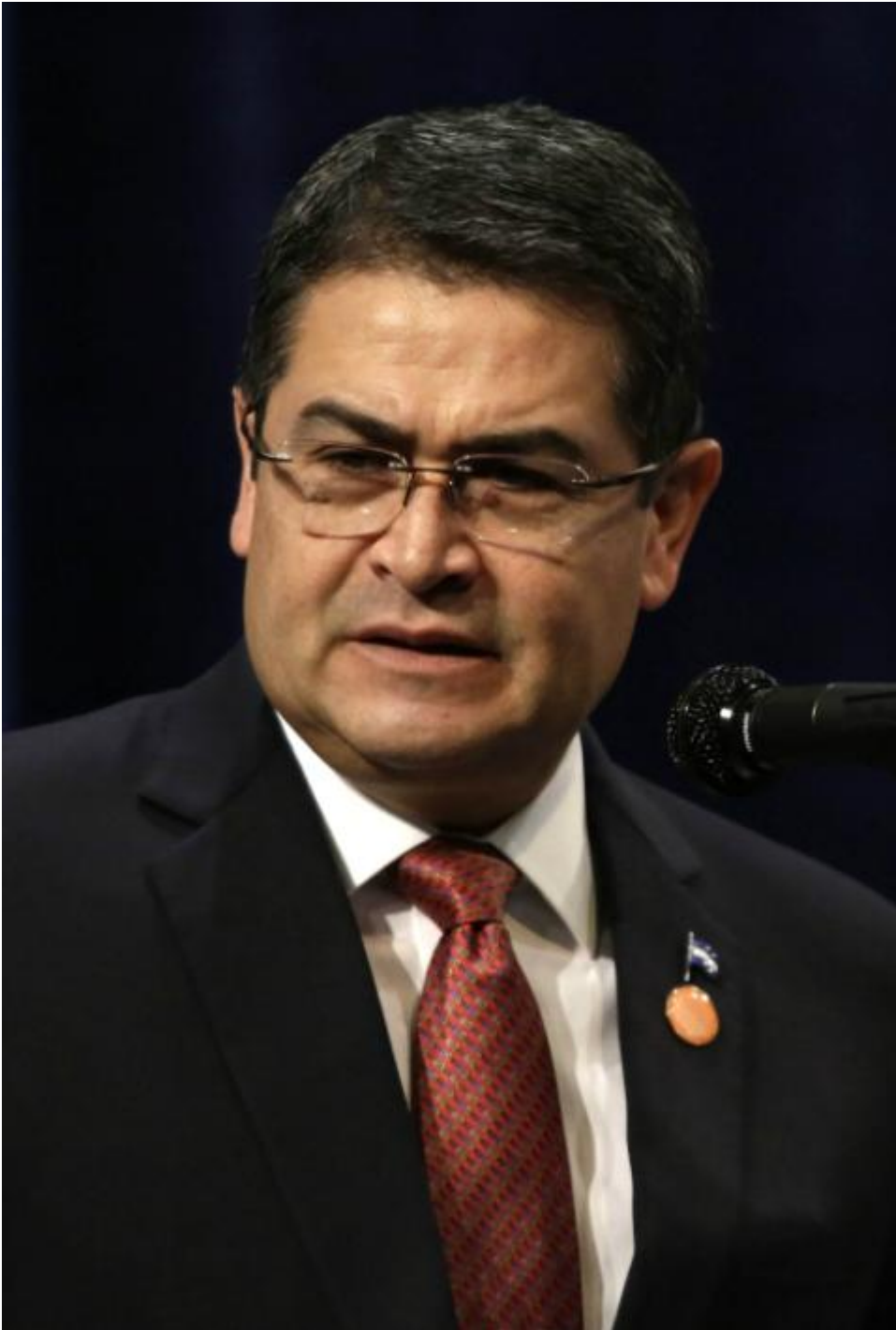
Honduras President Juan Orlando Hernández