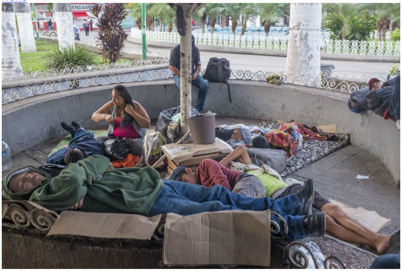
Migrants from Central America sleep in a kiosk in Tapachula, Mexico, May 24.