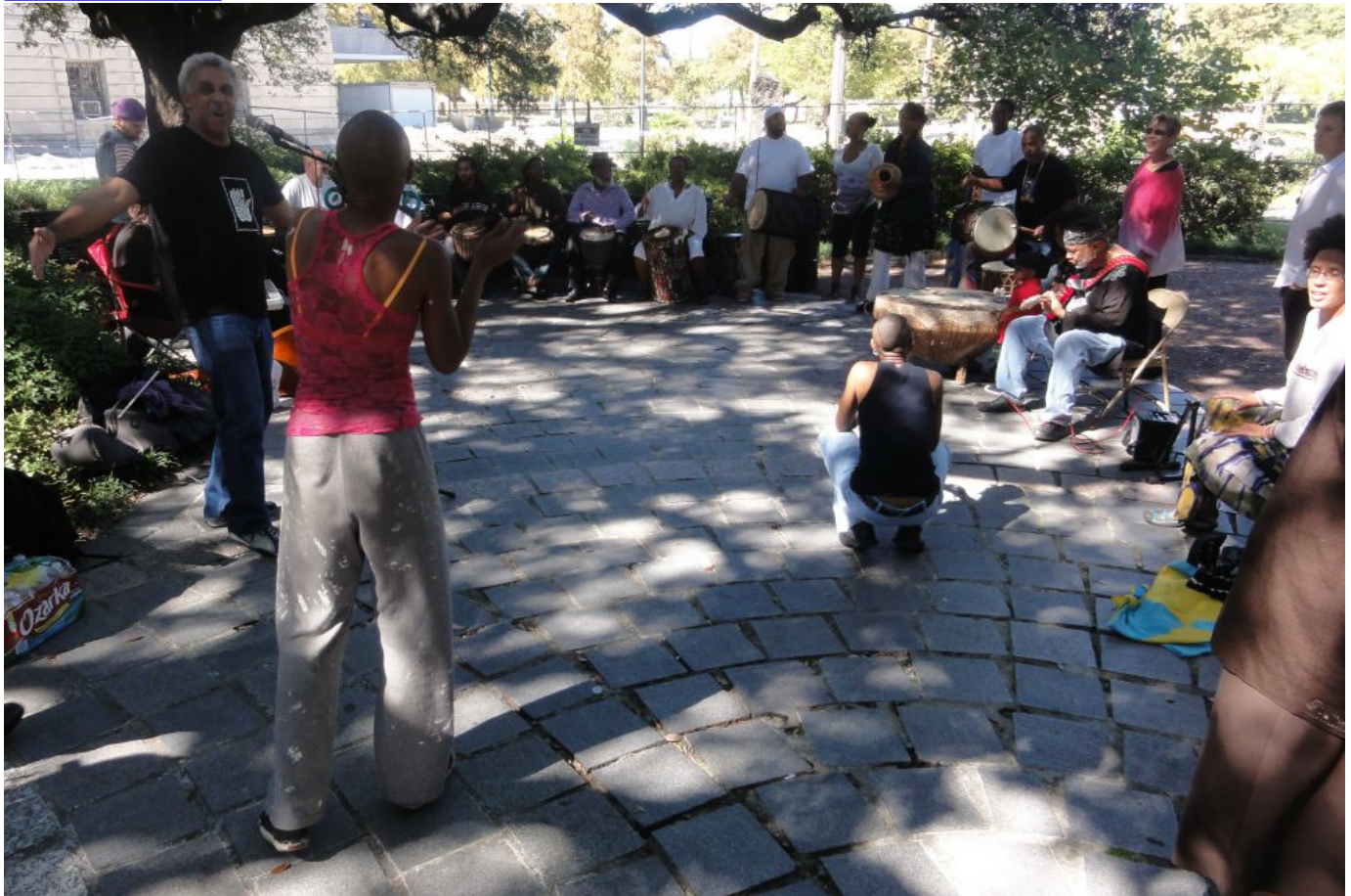
People drum and dance in Congo Square, New Orleans, October 2011.