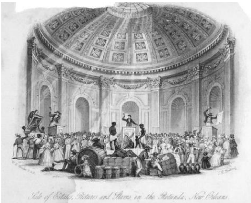
Etching depicting "Sale of Estates, Pictures and Slaves in the Rotunda, New Orleans," 1853

New Orleanians perfected the art of parades over centuries. Funerals with military bands were commonplace as early as the memorial for King Carlos of Spain in 1789. Berry illustrates the initiation of carnival parades in 1857 and how Reconstruction-era Mardi Gras parades featured costumes "with scalding, often racist satire," often mocking Union generals and Northern "carpetbaggers."