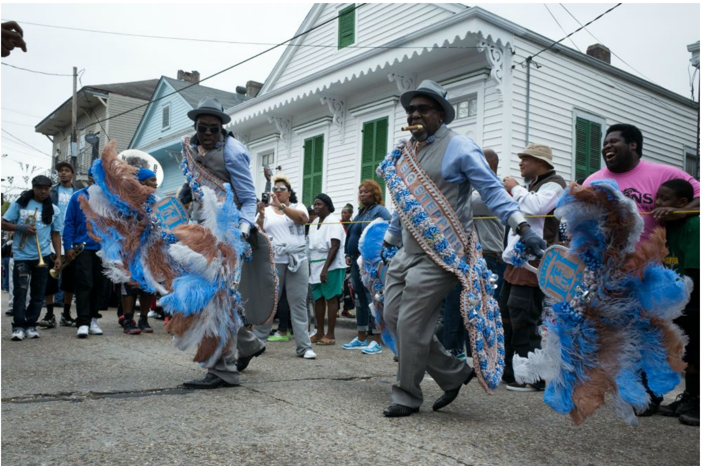
A 2015 Second Line parade in New Orleans

And while slave owners and priests relied heavily upon punishment to enforce slavery, they also allowed slaves to carry their own weapons, be entrepreneurial, work their own gardens, and to hunt, fish, trap and gather fruit to avoid the constant threat of famine. The place we now call Congo Square originally served as a marketplace where African peoples also "used the land to dramatize their past, resurrecting burial choreographies of the mother culture."