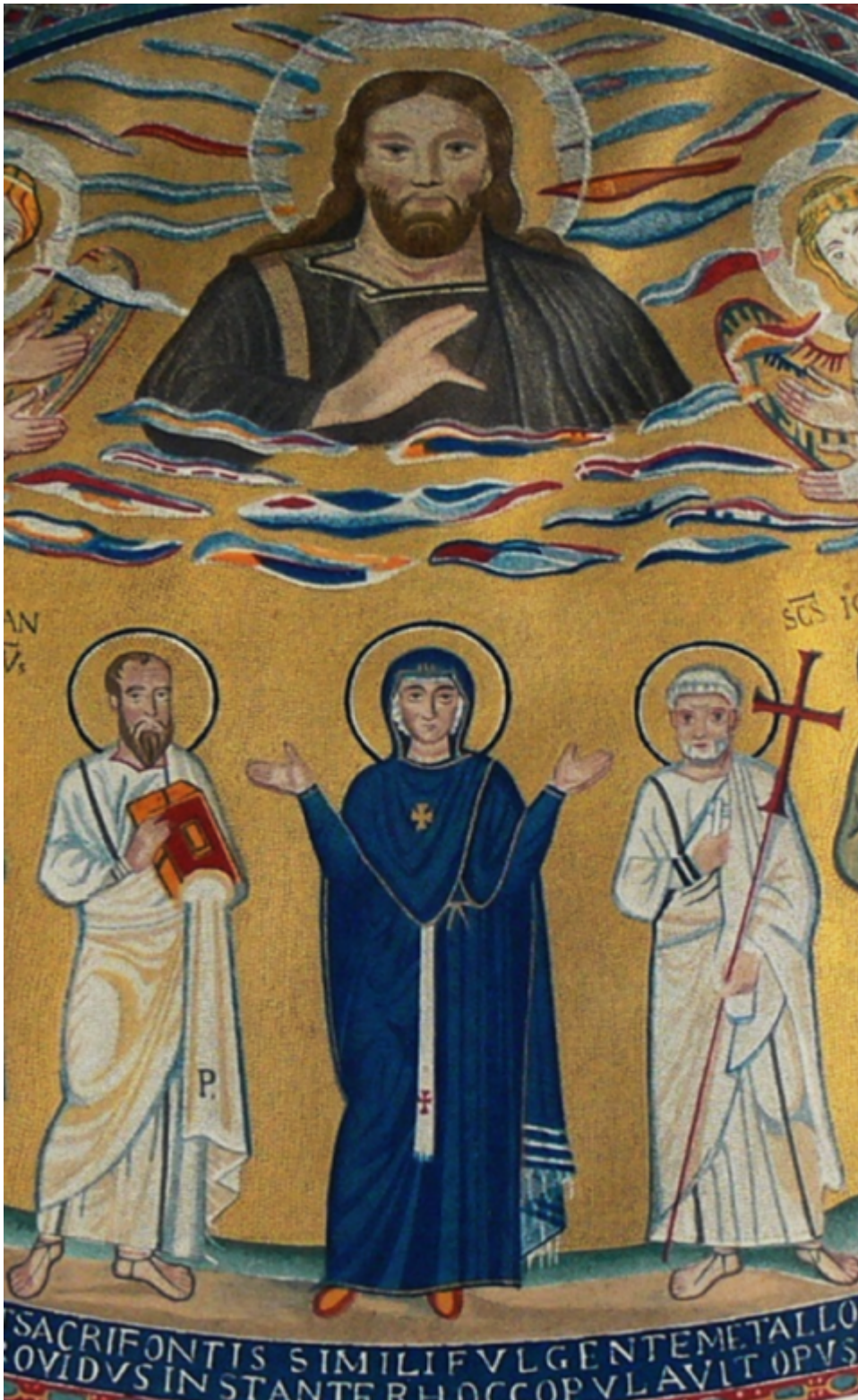
Altar apse mosaic, circa A.D. 650, San Venantius Chapel, Lateran Baptistery; an 1890s painting of the mosaic by Giovanni Battista de Rossi, that depicts Mary wearing an episcopal pallium with a red cross.