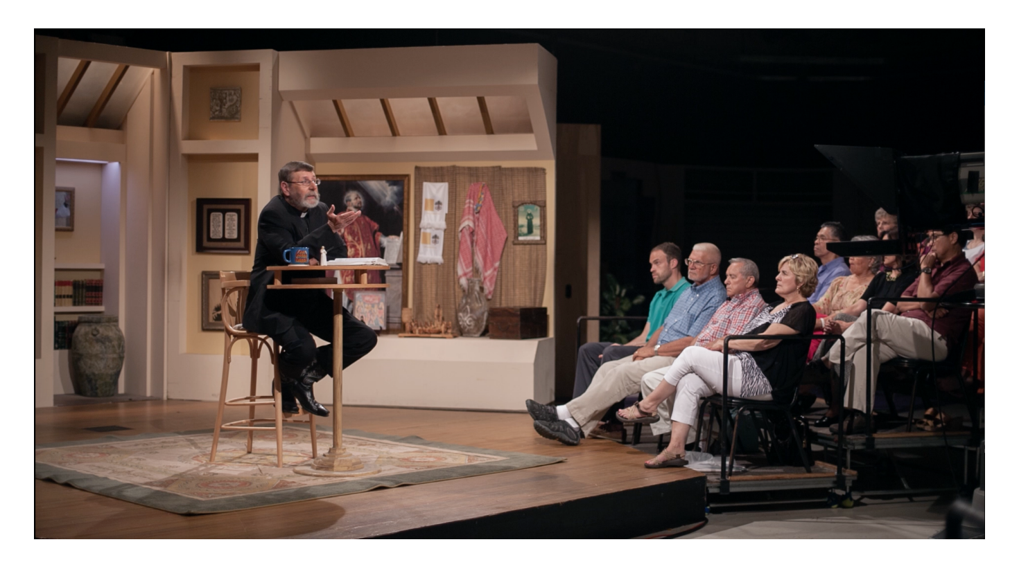
Jesuit Fr. Mitch Pacwa is a frequent host of EWTN television programs.

In 1999, Shrine of the Most Blessed Sacrament of Our Lady of the Angels Monastery — which features a 7-foot monstrance and has become a pilgrimage destination — was completed, thanks to five anonymous donors.