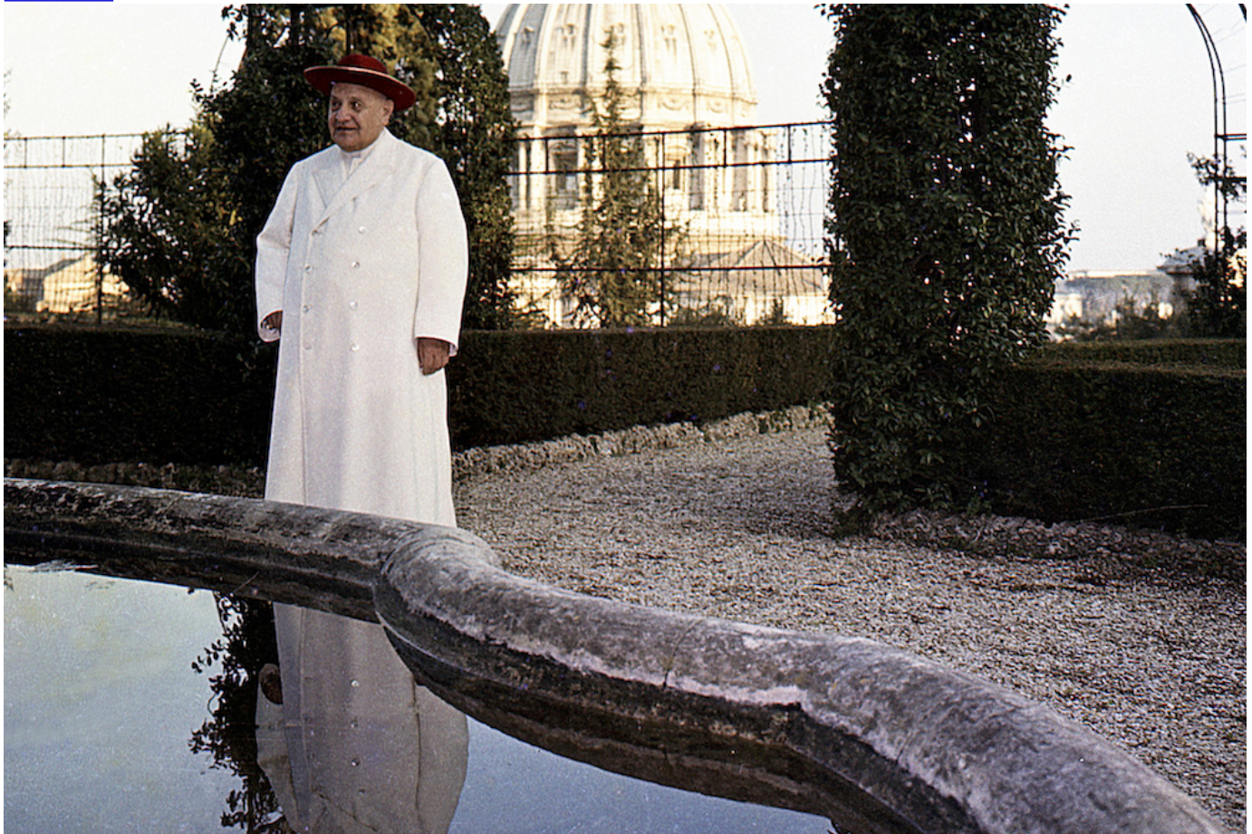
Pope John XXIII in the Vatican Gardens