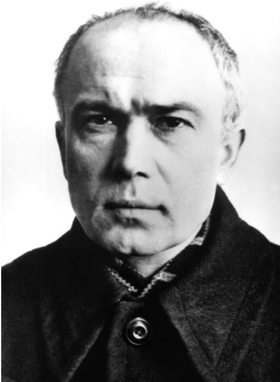
Father Maximilian Kolbe is pictured in an undated black-and-white file photo.

"All wars have direct and indirect consequences," said Schick. "The direct consequences are the deaths of soldiers and civilians, destruction of cities, villages and entire regions. Thus many human relationships are shattered and many souls are wounded."