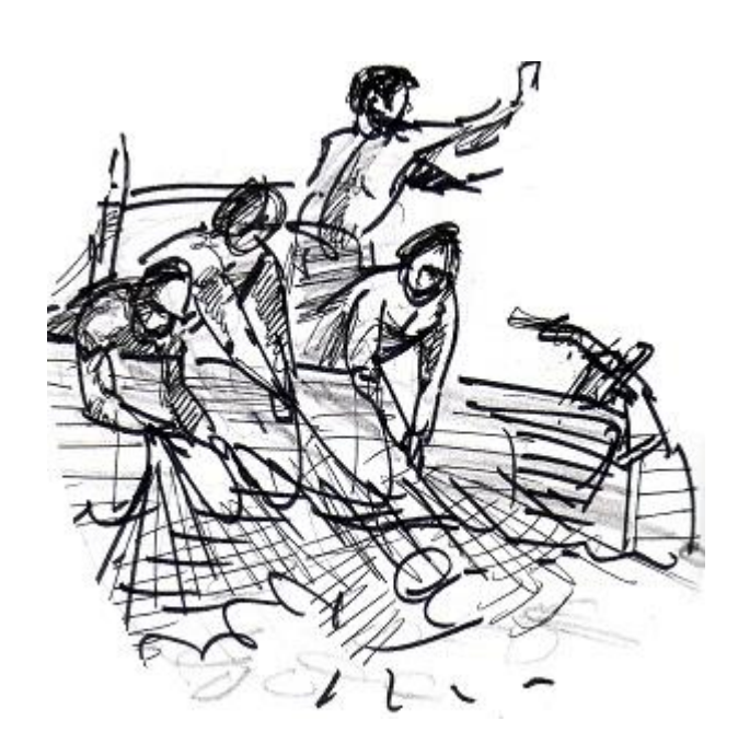
"Master, we have worked hard all night and have caught nothing" (Luke 5:5).

With the story of the amazing catch of fish, we see what a masterful storyteller Luke is, artfully selecting details and dramatic action to capture a key moment in the memory of the early church. The lake and the fishing boats are an important backdrop for the call and training of the first disciples. The Gospel itself is an invitation to leave behind the predictability and security of dry land to engage the mysteries of the deep.