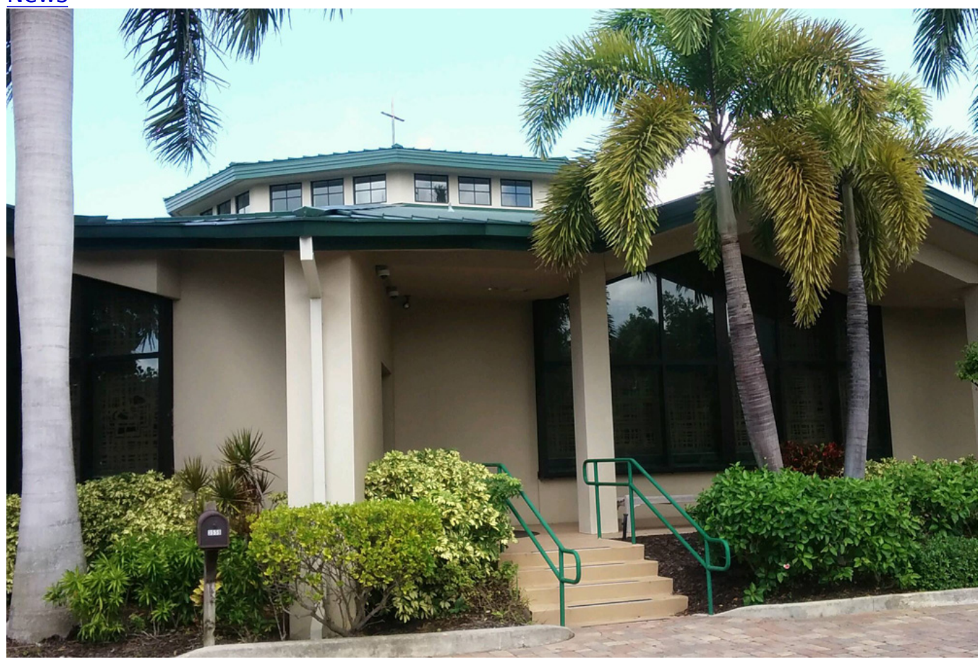
St. Isabel Church in Sanibel Island, Florida