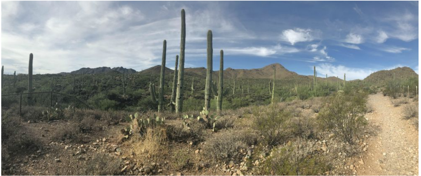
Sonoran Desert, Tucson, Arizona