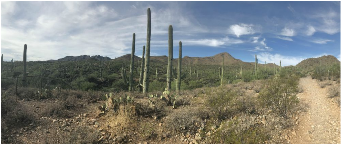
Sonoran Desert, Tucson, Arizona