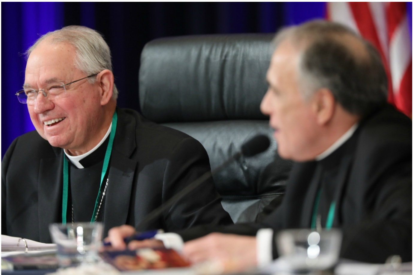
Los Angeles Archbishop José Gomez, president-elect of the U.S. Conference of Catholic Bishops, and outgoing president, Galveston-Houston Cardinal Daniel DiNardo, smile during the U.S. bishops' fall general assembly in Baltimore Nov. 13.

The bishops also voted to begin developing a formal statement and comprehensive vision for Hispanic/Latino ministry in response to the synodal V Encuentro process. And they elected the first Latino as president of the conference, Los Angeles Archbishop José Gomez .