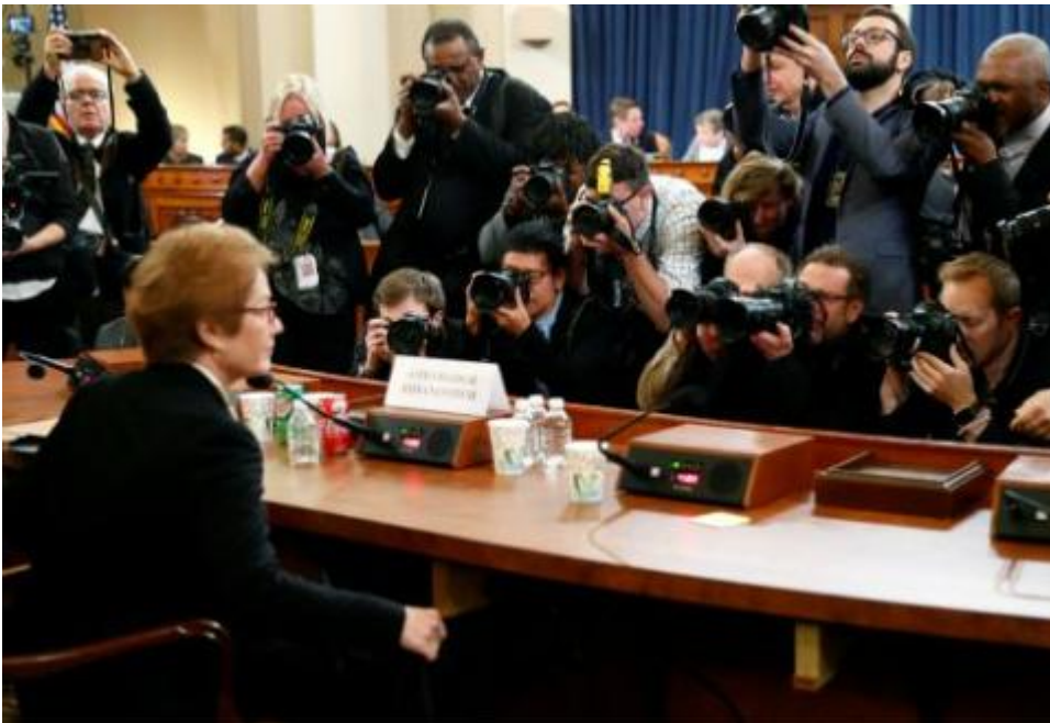
Marie Yovanovitch, former U.S. ambassador to Ukraine, testifies Nov. 15 in Washington before a House Intelligence Committee hearing as part of the

As morally repugnant as Trump's pardons were, they were matched in ethical grotesqueness by his attacks on lifelong patriots who have served this country in a variety of challenging circumstances.