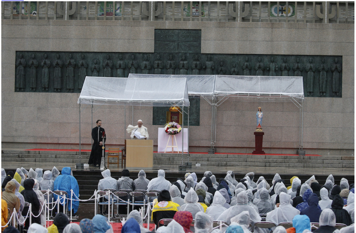
Pope Francis speaks as he pays homage to the holy martyrs at the martyrs' monument on Nishizaka Hill in Nagasaki, Japan, Nov. 24.