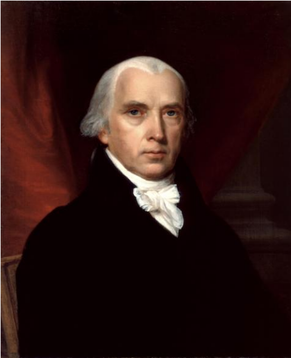
1816 portrait of James Madison, fourth President of the United States