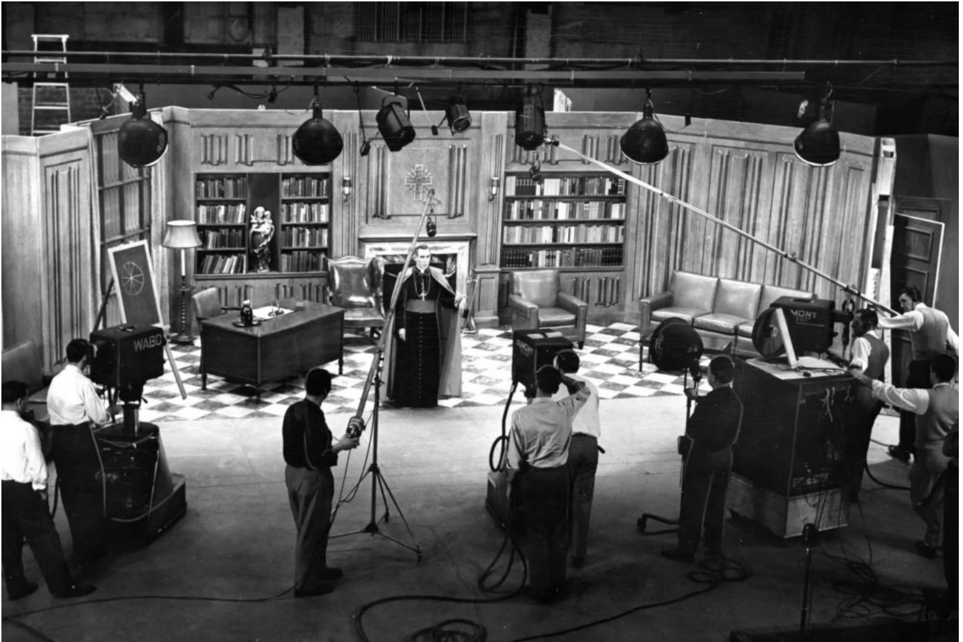
Archbishop Fulton Sheen, the famed media evangelist, mission promoter and author, is pictured in an undated photo speaking during a television broadcast.