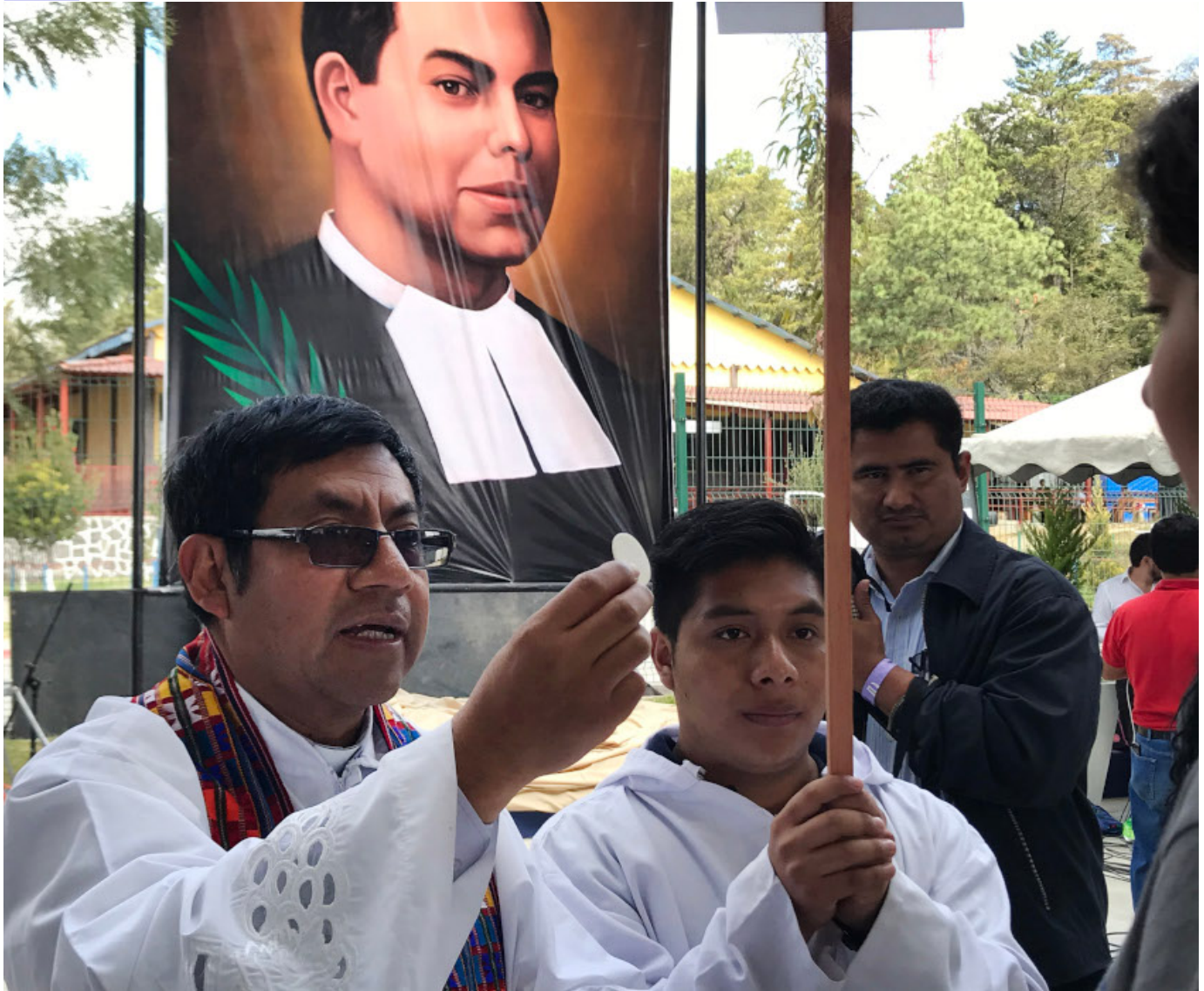
A clergyman distributes Communion during the beatification Mass of Blessed James Miller in Huehuetenango, Guatemala.