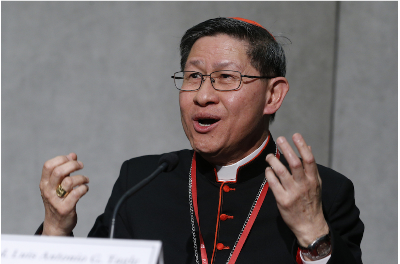
Philippines Cardinal Luis Antonio Tagle speaks at the Vatican Oct. 23, 2018.