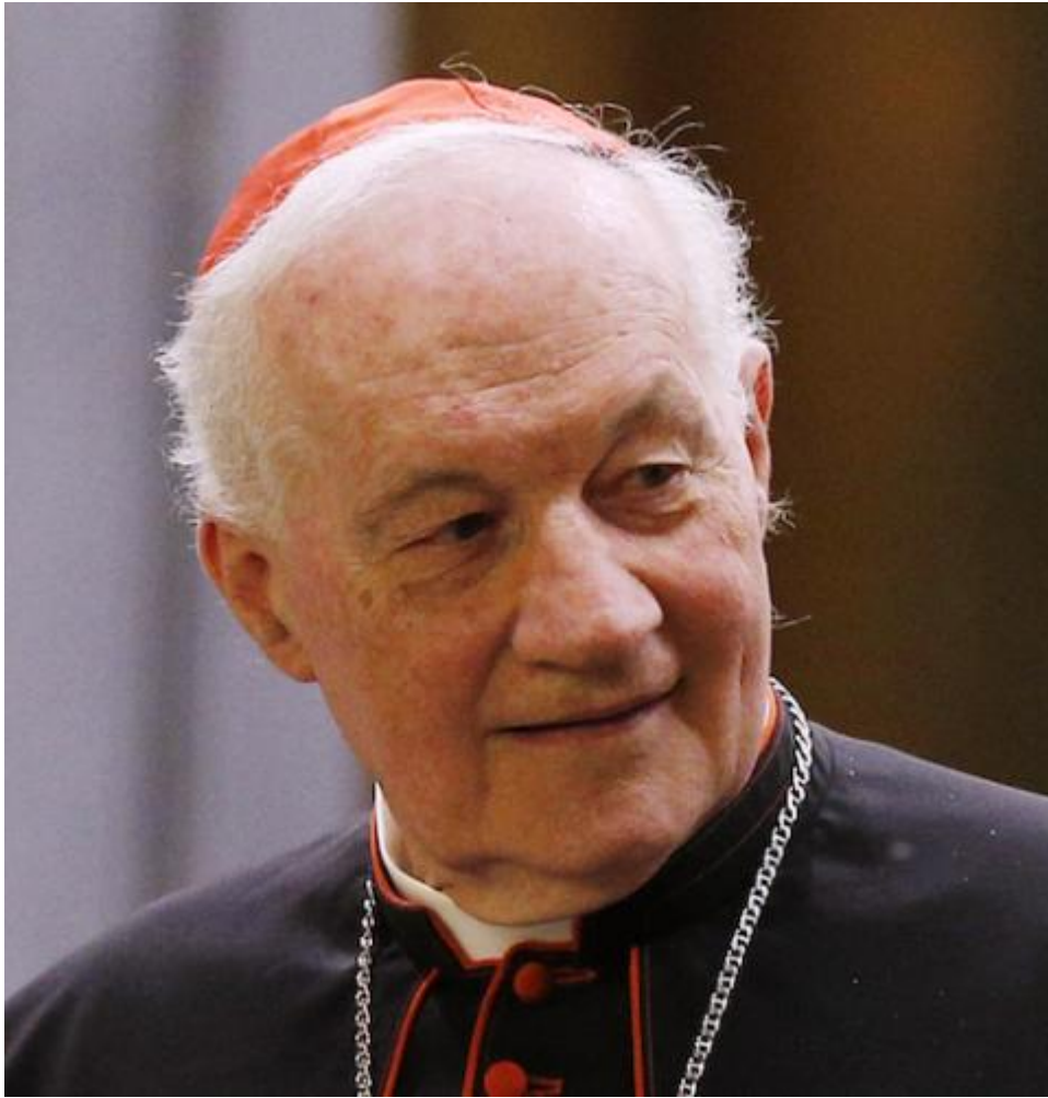
Cardinal Marc Ouellet, October 2018

He was first appointed bishop of the diocese of Imus by Pope John Paul II in 2001 and later archbishop of Manila in 2011 by Pope Benedict XVI, who also made the Filipino a cardinal in 2012.