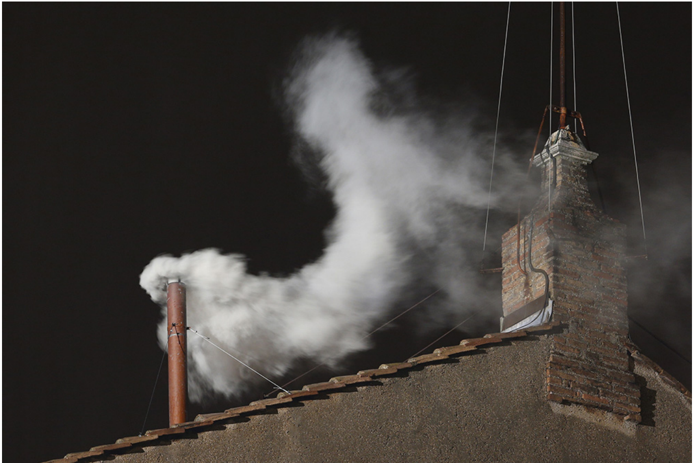
White smoke billows from the chimney of the Sistine Chapel March 13, 2013, at the Vatican.