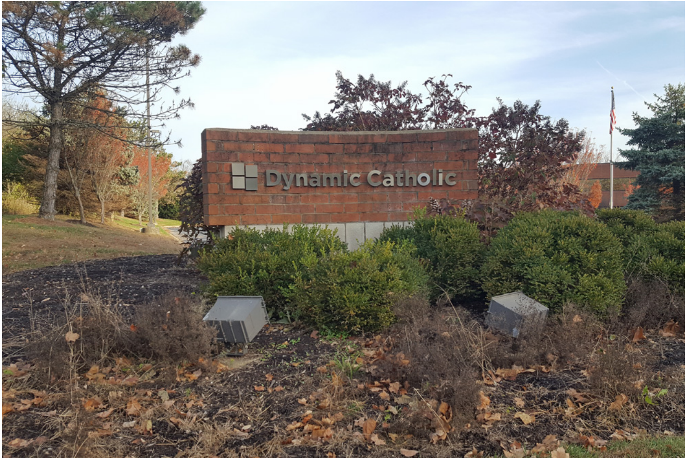
Sign for the Dynamic Catholic Institute in Erlanger, Kentucky