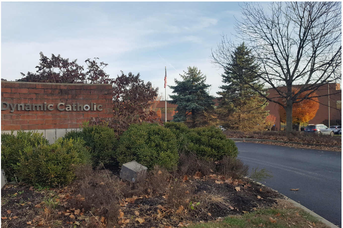
Exterior of the Dynamic Catholic Institute building in Erlanger, Kentucky