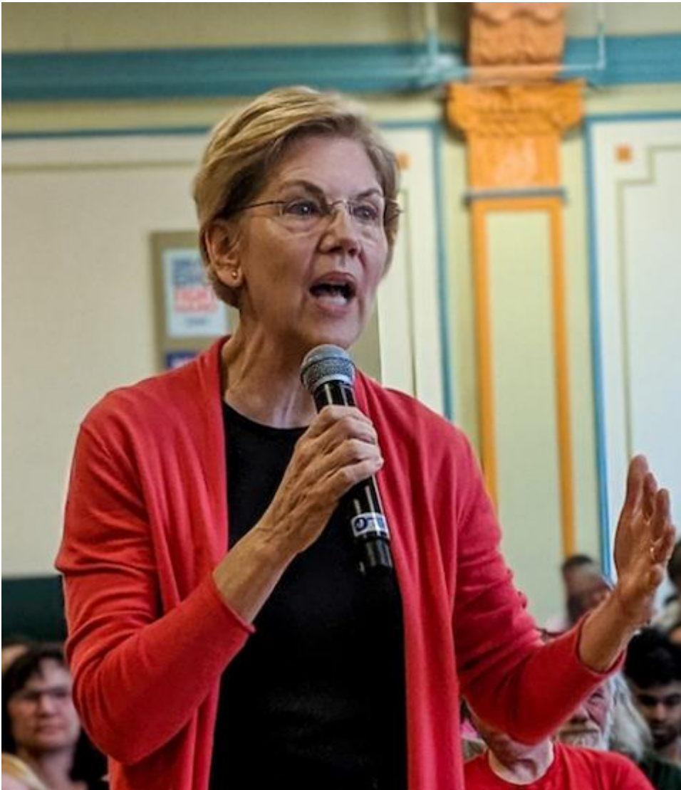
Sen. Elizabeth Warren in Nashua, New Hampshire, May 2019

create our own families. I believe that it is Warren's approach, not harsh and restrictive laws enforced mainly by often hypocritical men, that is the better, if imperfect, reflection of family values.