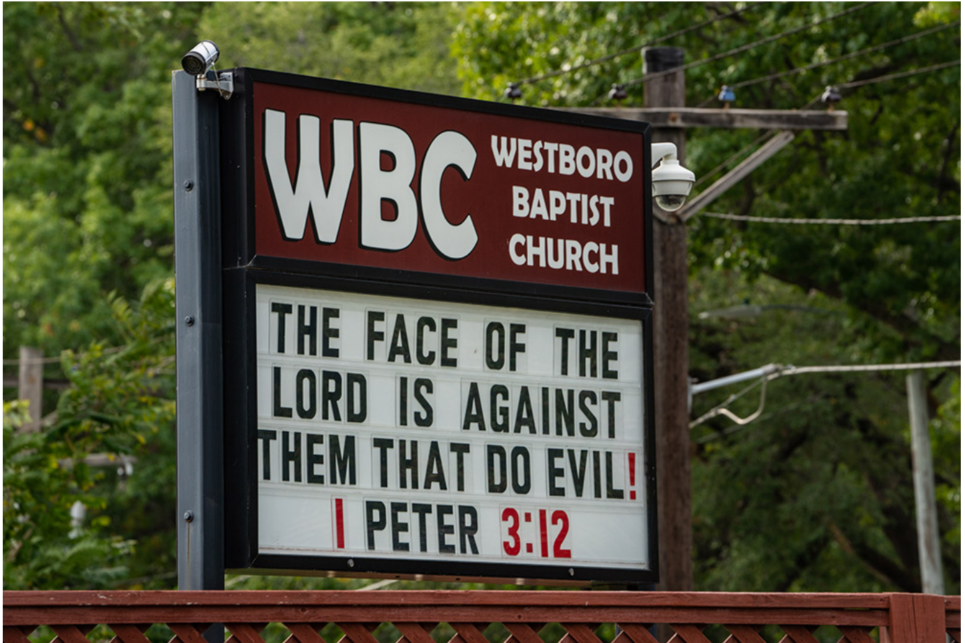
A sign at the Westboro Baptist Church in Topeka, Kansas