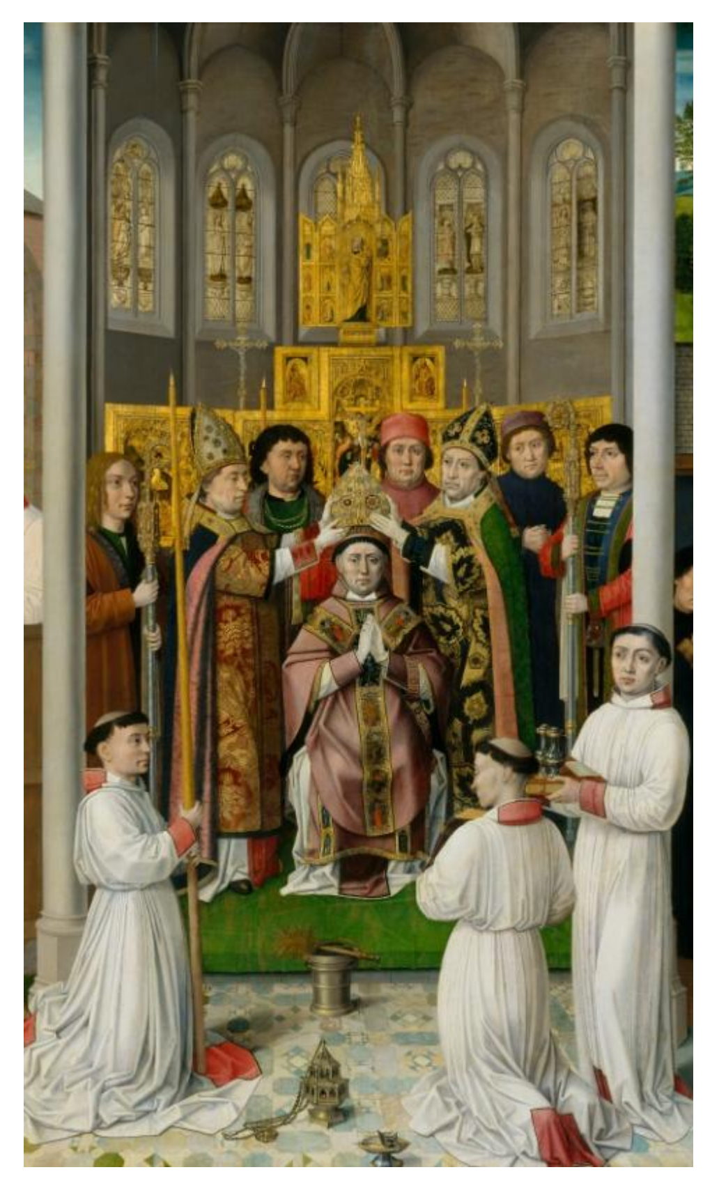
"Scenes from the Life of St. Augustine of Hippo" (circa 1490, detail) by Master of St. Augustine (Metropolitan Museum of Art)