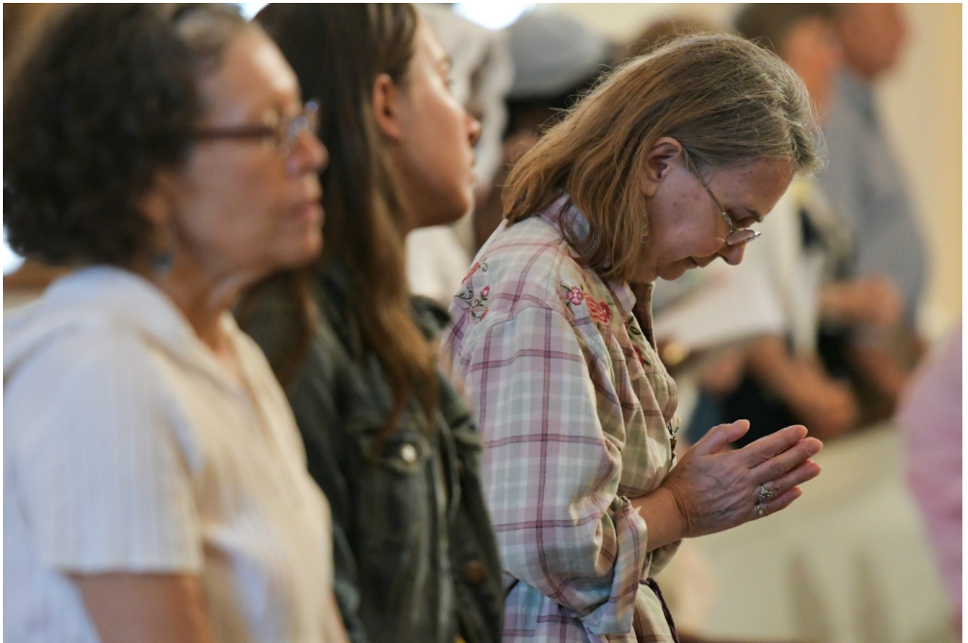
A woman prays during the opening Mass of the Fortnight for Freedom June 21, 2017, at the Basilica of the National Shrine of the Assumption of the Blessed Virgin Mary in Baltimore.