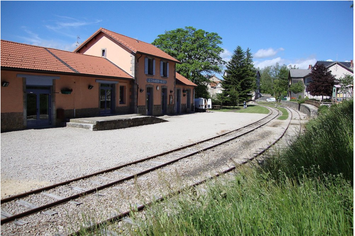
Train station of Le Chambon-sur-Lignon, a village on the Vivarais Plateau, France