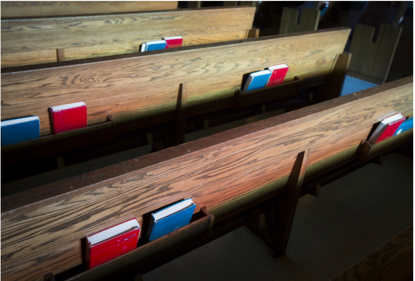
Pews are seen at St. Camillus Church in Silver Spring, Maryland, in 2018.