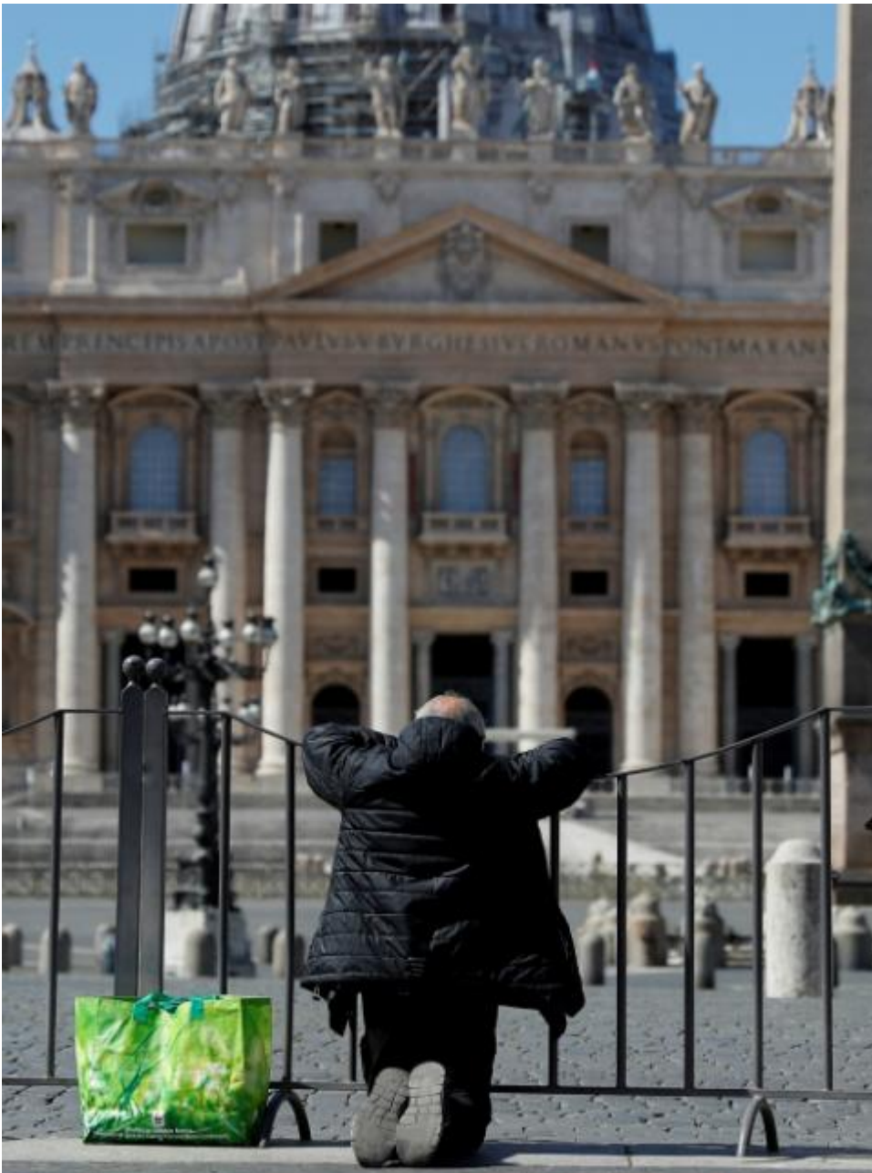
A man prays in front of an empty St. Peter's Square in Rome March 25.

For Catholics, the spring also brings the fifth anniversary of Pope Francis' social encyclical on ecology, " Laudato Si' , on Care for Our Common Home," with the Vatican sponsoring a weeklong celebration to rally the church to greater steps to care for God's creation.