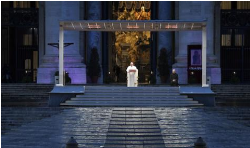
Pope Francis leads a prayer service in an empty St. Peter's Square at the Vatican March 27.

Fortunately, good pastoral sense prevails in many places. Some women religious communities are conducting funeral services without benefit of clergy. A sister dies in a motherhouse, and the leadership team handles the wake, funeral and burial. The leaders, and perhaps a few close friends of the deceased (not to exceed the limits of how many can gather legally in the locale) carry out a dignified celebration of the person's life. After the service, they process to the cemetery for the final prayers and burial. It is livestreamed throughout the motherhouse and to friends and family at a distance, providing as much comfort as possible.