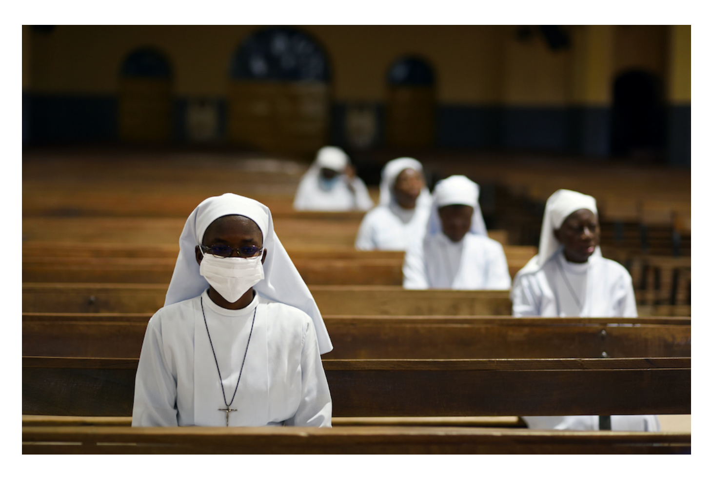
Nuns attend Holy Thursday Mass in a nearly empty cathedral April 9 in Ouagadougou, Burkina Faso, during the COVID-19 pandemic.