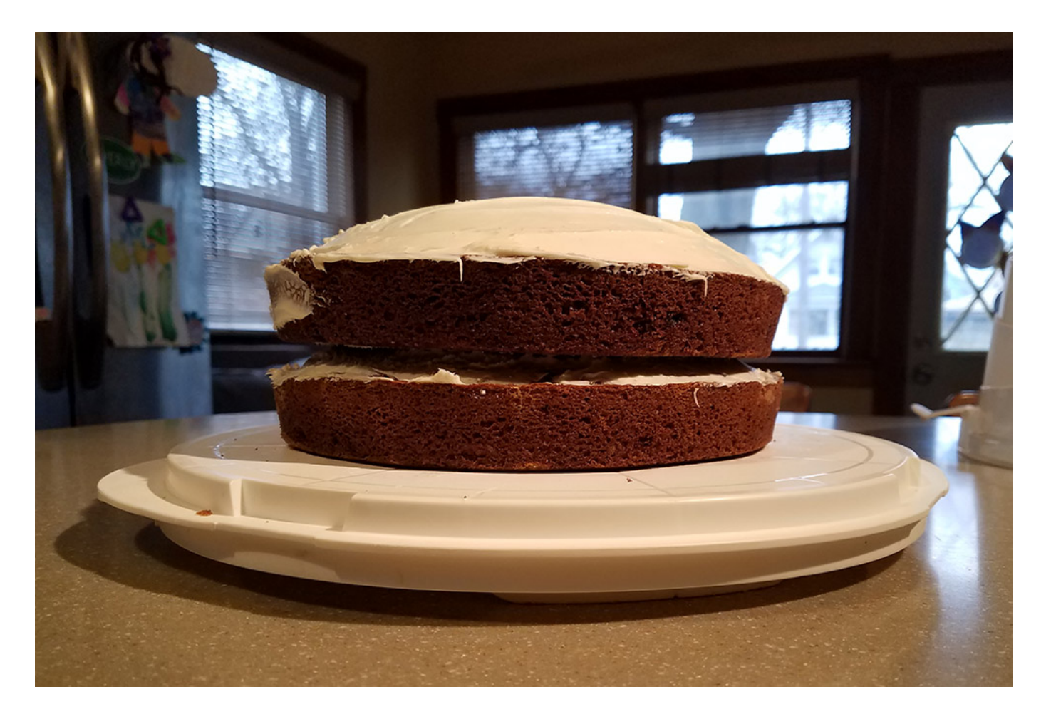
The author's carrot cake, his wife's favorite

I have never suffered from a subpar music instructor. They have all been somewhere between great and phenomenal teachers and one of them, in a high school symphonic band, used to admonish us, "Don't rest on the rests!" This was not a strange or even masochistic demand; this was not a call to be like Martha and constantly keep busy in our space. The void, the stoppage, the nothingness comes between songs. The rest is an essential part of the music.