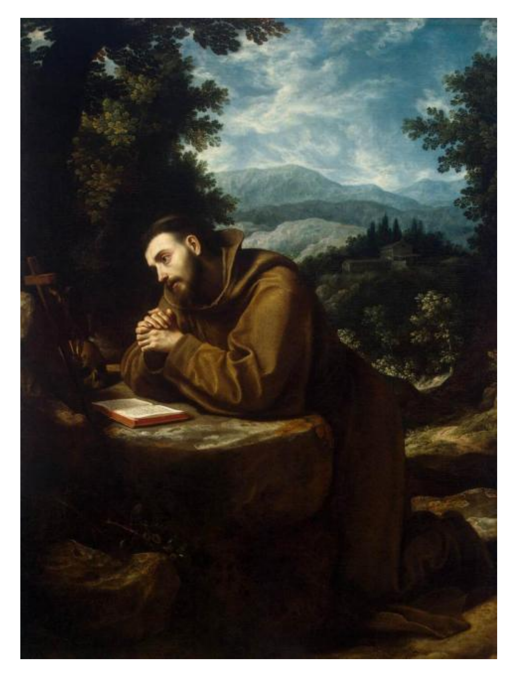
St. Francis of Assisi by Cigoli