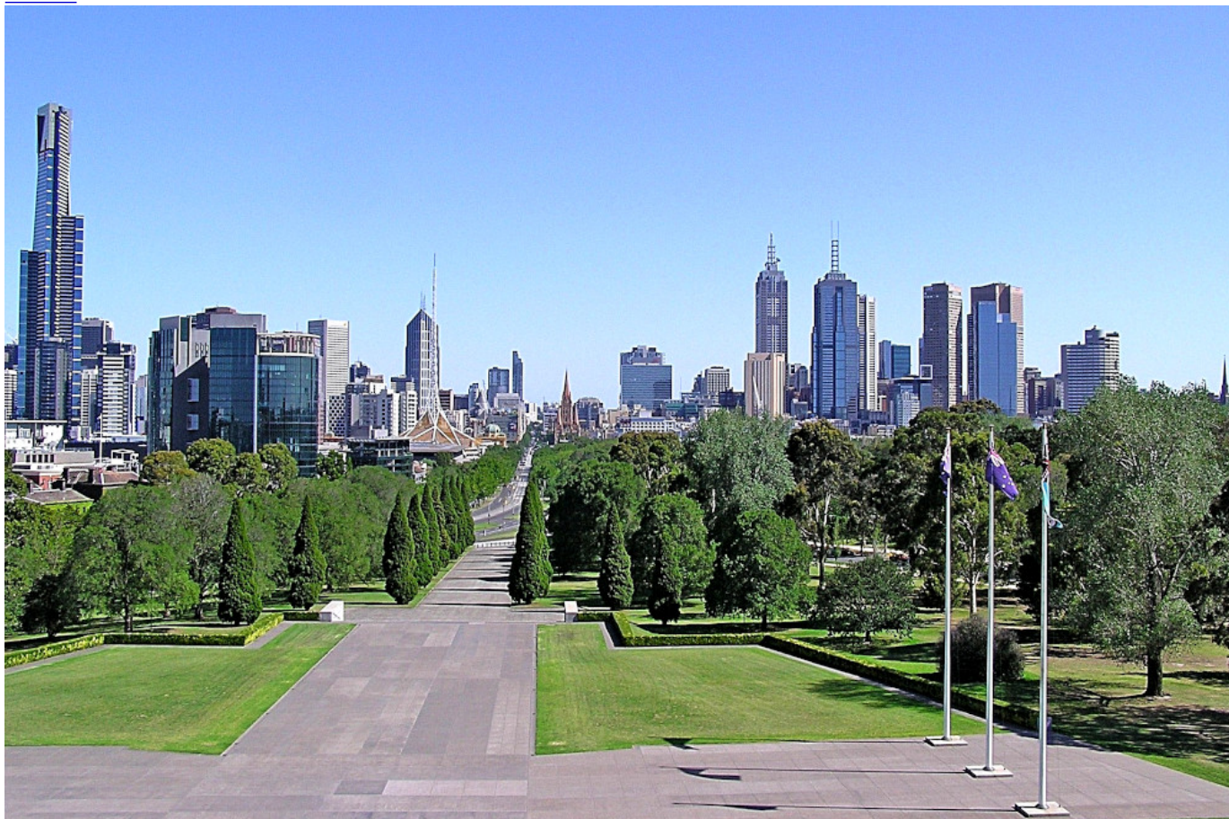
Shrine of Remembrance, Melbourne, Australia.