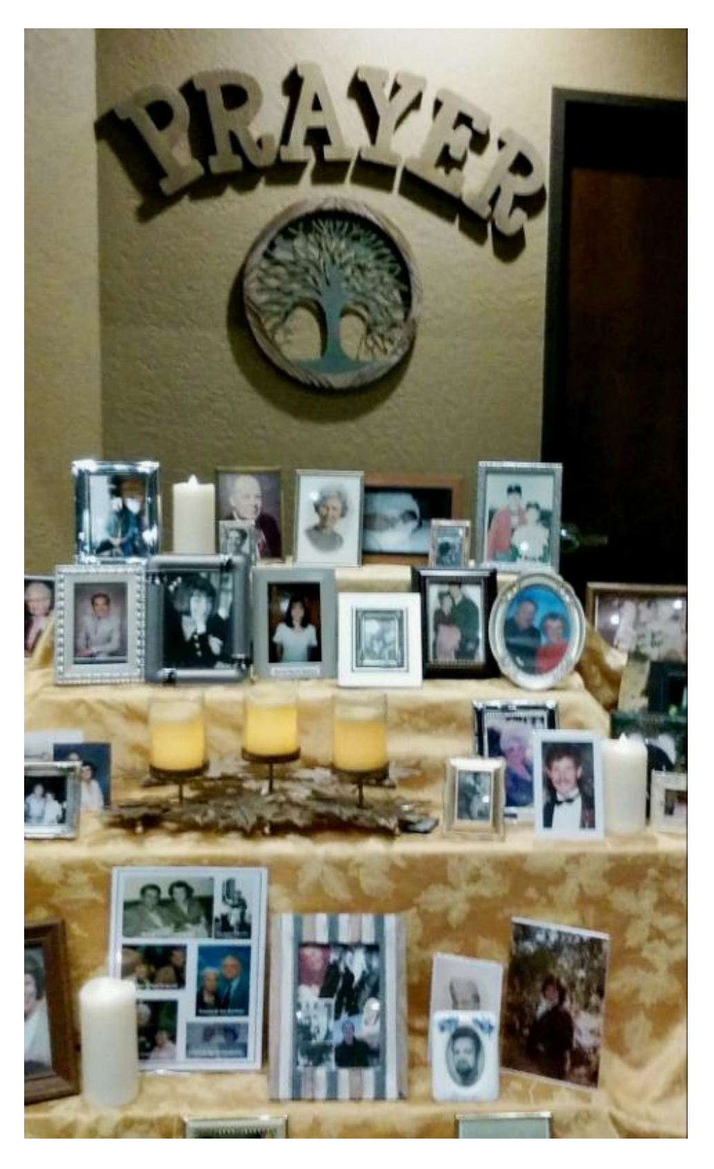
A shrine for departed family and friends at Holy Communion Church