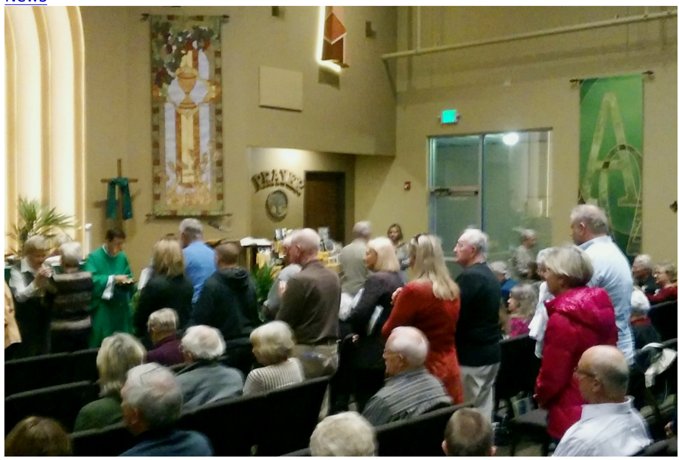
Mass at Holy Communion Evangelical Catholic Church in Bend, Oregon, in November 2019