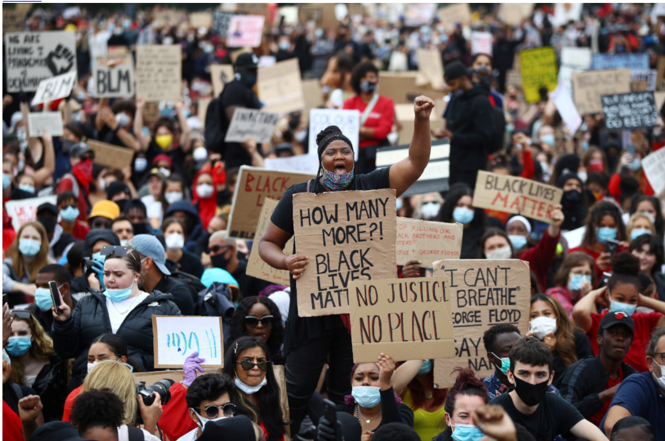
Black Lives Matter protest June 3, 2020, in London.