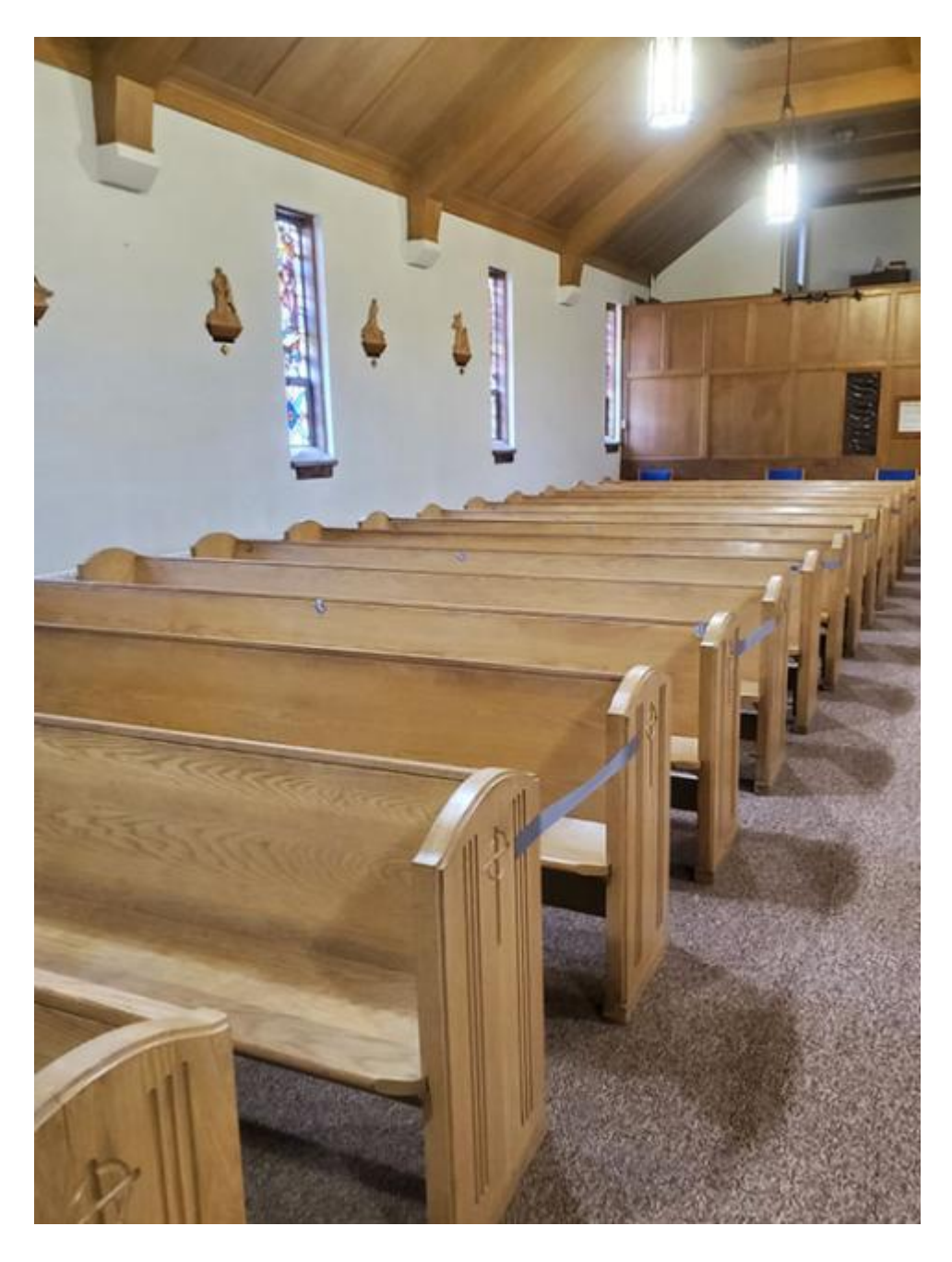
Pews of St. Sebastian Church in Kingwood, West Virginia

Back in Preston County, Switzer said he also has real concerns for the seniors who make up about 60% of St. Sebastian's congregation and about 80% of the other two sites. His fear is that people living in a rural area with a lower infection rate than even the rest of the state will think COVID-19 only happens in other places.