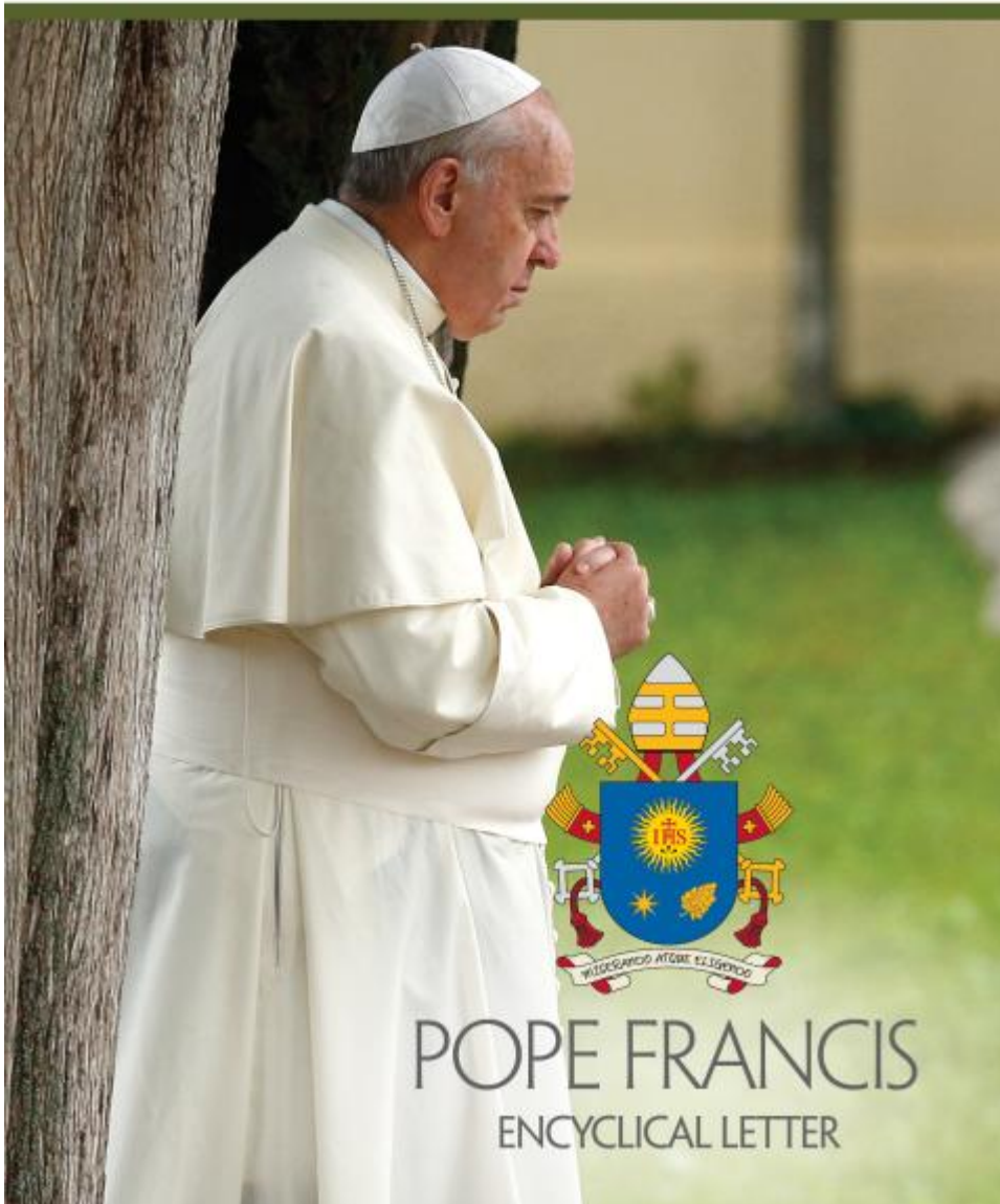
Cover of the English edition of "Laudato Si', on Care for Our Common Home."